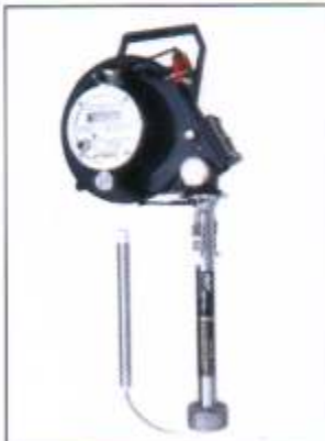
GAS-TIGHT TYPE PORTABLE OIL / WATER INTERFACE DETECTOR MODEL T2000-TFC-01 TOP CONN. : PF 2-1/4" TAP FUNCTION: ULLAGE, TEMPERATURE OIL / WATER INTERFACE