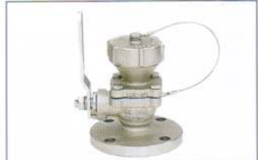
SHUT ON / OFF VALVE MODEL: TVC-01 TOP CONN. : PF 2-1/4" TAP FLANGE CONN. : 50A JIS 5K F.F FUNCTION: VAPOR LOCK INSTALLATION OF PMS BOTTOM DRYNESS CHECKING, ETC.

Supply with the portable type manufactured a suitable use, to measure the various data in tank