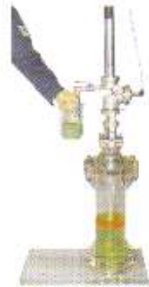
View of Sampling