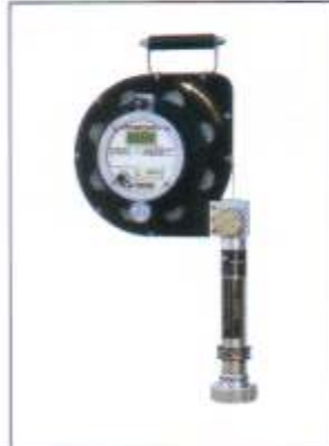
RESTRICTED TYPE PORTABLE OIL / WATER INTERFACE DETECTOR MODEL T2000-TFS-01 TOP CONN. : PF 2-1/4" TAP FUNCTION: ULLAGE, TEMPERATURE OIL / WATER INTERFACE