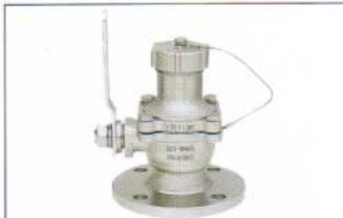
SHUT ON / OFF VALVE MODEL: TVC-02 TOP CONN. : PF 2-1/4" TAP FLANGE CONN. : 80A JIS 5K F.F OR 50A JIS 5K F.F FUNCTION: VAPOR LOCK INSTALLATION OF PMS MAIN TANK GAUGING STATION (ULLAGE GAUGING & SAMPLING)