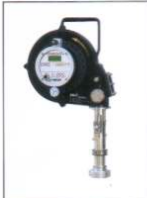
GAS-TIGHT TYPE PORTABLE OIL / WATER INTERFACE DETECTOR MODEL T2000-TFC-02 TOP CONN. : PF 2-1/4" TAP FUNCTION: ULLAGE, TEMPERATURE OIL / WATER INTERFACE