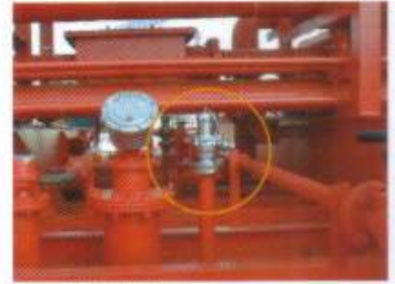
View of Installation Shut On/Off Valve Model : TVC-02