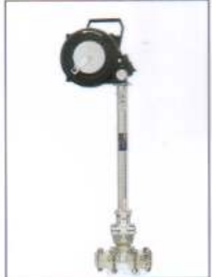
CARGO SAMPLING DEVICE MODEL T2000-TSS-02 TOP CONN. : PF 2-1/4" TAP FUNCTION: LIQUID SAMPLING